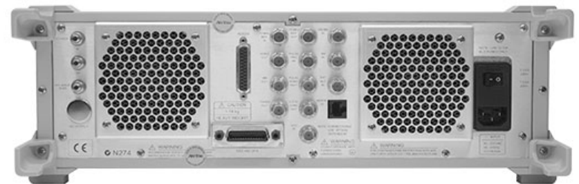
RF/Microwave/Millimeter Signal Generator MG3690C